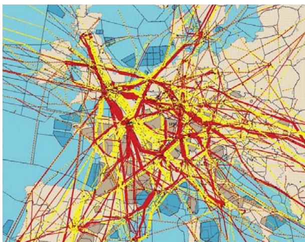
The core area of Europe – one of the highest traffic densities in the world.